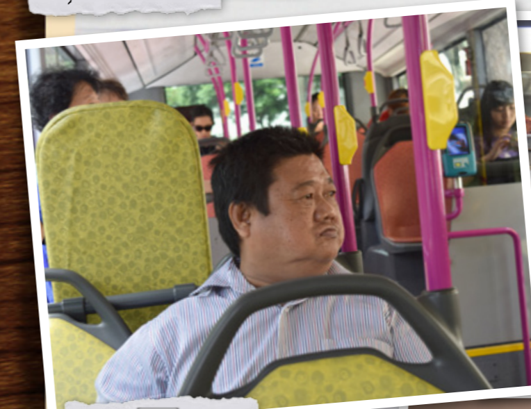
The journey back home.