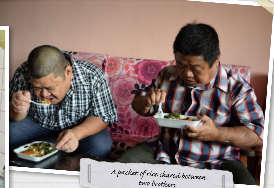
A packet of rice shared between two brothers.